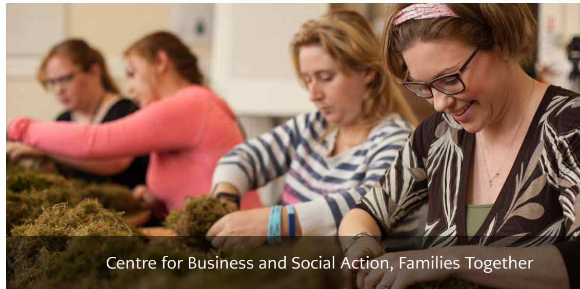
Centre for Business and Social Action, Families Together

All documents, booklets, promotional materials, flyers and forms we produce in Wales will be available in Welsh and English. The Welsh language will be treated no less favourably than the English language in our printed materials.